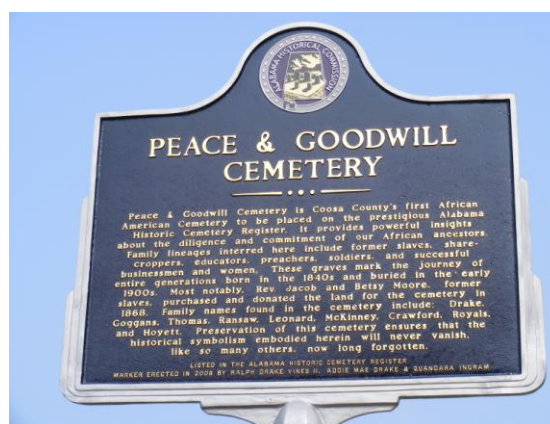
Historical Marker (Large 30”h x 42”w)